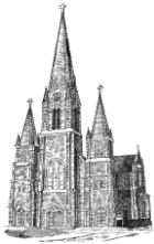
St. Josaphat Church